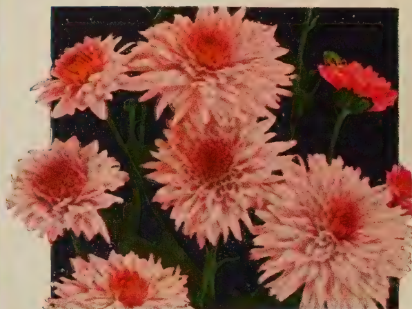
ORCHID HELEN. 60c each; 3 for $1.50